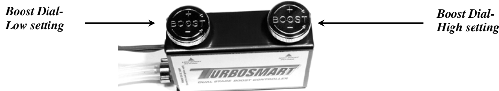
Figure 2: Top View of DS GBCV